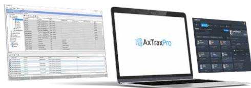
AxTraxPro™ Management Software

The networked controllers are compatible with any standard Wiegand peripheral device, including Rosslare readers, biometric terminals and accessories – all fully managed by the AxTraxPro™ management software.