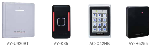
AY-U920BT AY-K35 AC-Q42HB AY-H6255