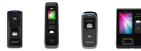
AY-B8550 AY-B9250BT AY-B8650 AY-B9350