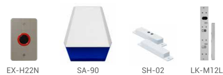
EX-H22N SA-90 SH-02 LK-M12L